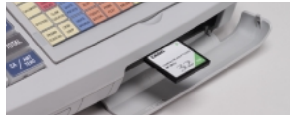
• CF card interface for fast, simple data transfer