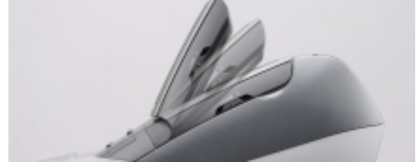
• The LCD display can be tilted to the optimal reading angle.