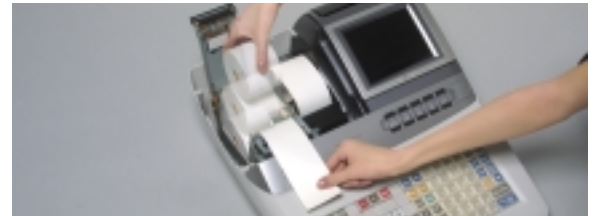
• Drop-in paper-loading for quick, easy paper roll changes